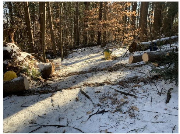
Cluster of Blowdowns Cleared